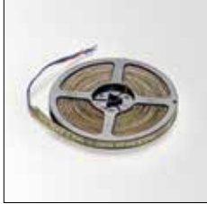
5m - 24V-DC MOUNTED