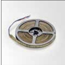
5m - 24V-DC MOUNTED