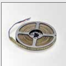
LED FLEX IN & OUT

SUITABLE FOR LED FLEX IN & OUT PAG PRO 820