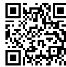
Image may differ from the actual product